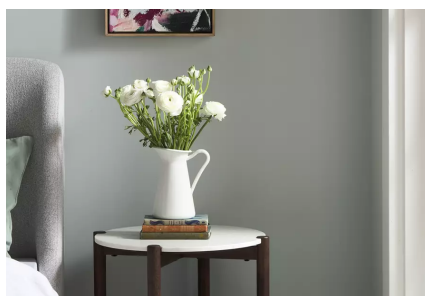
Walls: Porter's Eggshell Finish in Chintz Grey